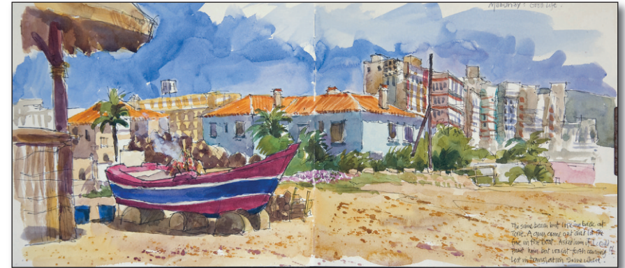
Andalucia The beach at Torre del Mar (top); Relaxing in the bar at El Pimpi, Malaga (bottom).