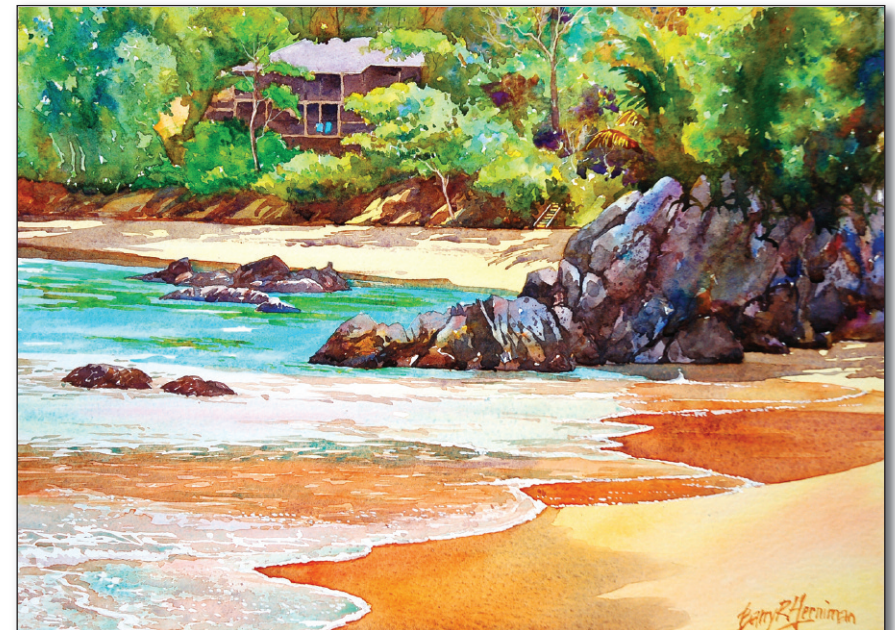
Tobago Beach The quintessential tropical beach scene. Tobago was everything you could ask for on a Caribbean island, sun, sand and turquoise seas. Watercolour 41x30cm.