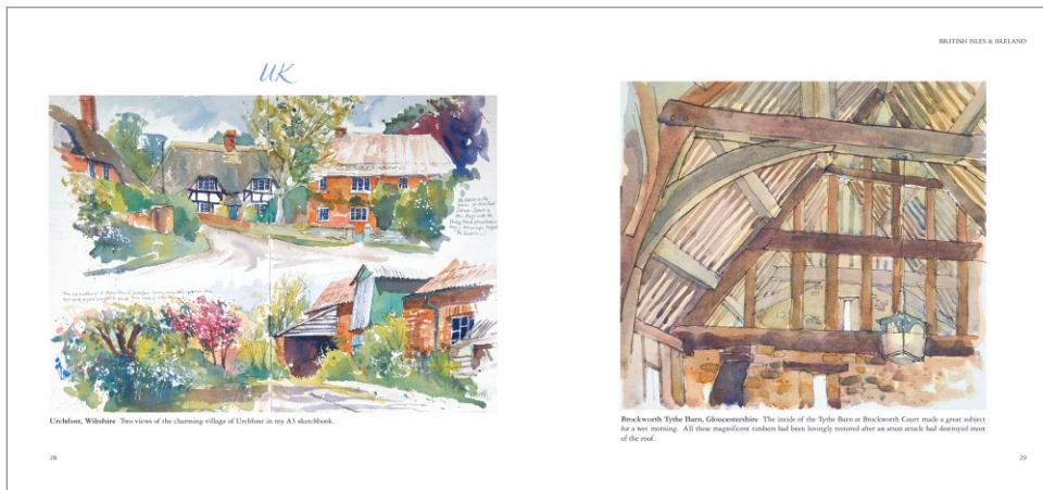
Below: Example of a double-page spread.